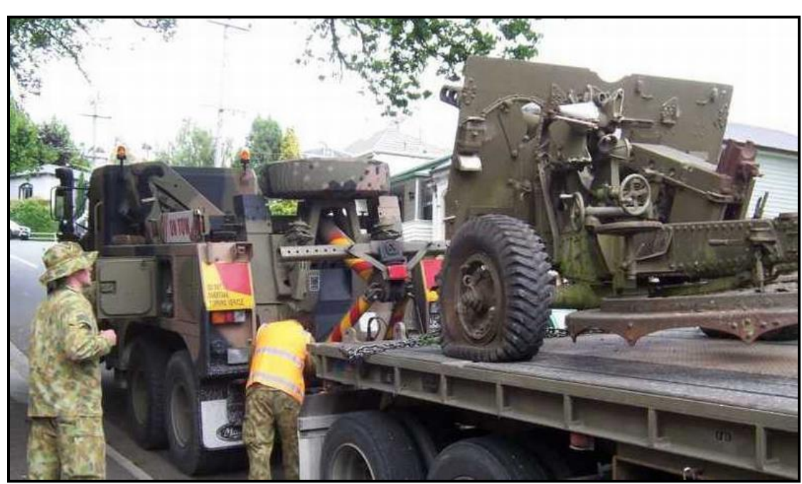
Not the usual way to tow a grand old gun!

A 25 Pounder gun which had been stored, privately, in Launceston for many years, was picked up by the Artillery retrieval unit on 26<sup>th</sup> November 2008 and, over the last month or so, it has been undergoing its total decommissioning - and the start of a lot of necessary refurbishment by a few willing volunteers - prior to its ultimate journey and installation as a Memorial centre-piece.