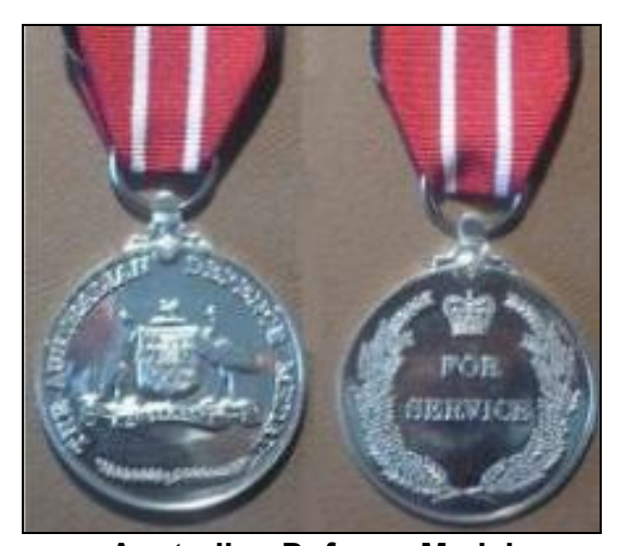
Australian Defence Medal

It has come to our notice that a former local Bombardier applied for the latest Australian Defence Medal and received a notification back that his request would be processed in due course. I'll bet his smile was pretty wide as he saw that his former rank had been unexpectedly and rapidly elevated to that of - Brigadier.....! TRUE.