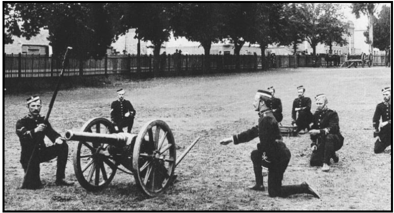
Launceston Volunteer Artillery training at Paterson Barracks 1902

Other sources report that, at that time, the total military forces comprised 18,602 and an additional 8,862 unpaid volunteers. The 1901 audit also revealed that Tasmania's contribution to that number was 2,764 All Ranks - plus 210 Cadets.