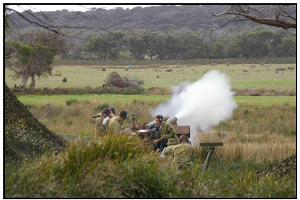
Live shoot - Stoney Head Artillery range - June 2008

1971 – 16<sup>th</sup> Field Battery, RHQ and HQ Battery - 6<sup>th</sup> Field Regiment RAA 1976 – 16<sup>th</sup> Field Battery RAA (Independent) Launceston Detachment and Battery Headquarters.