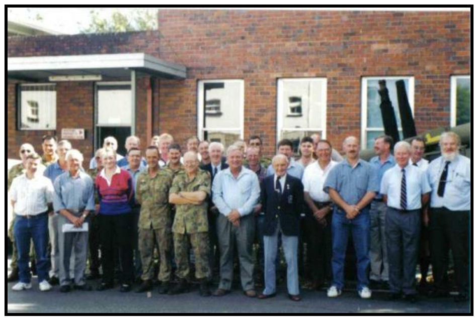
Royal Australian Artillery Association of Tasmania Initial Meeting 18th March 2000

The ROYAL AUSTRALIAN ARTILLERY ASSOCIATION OF TASMANIA INC. "HAPPY 8^{TH} BIR THDA Y"