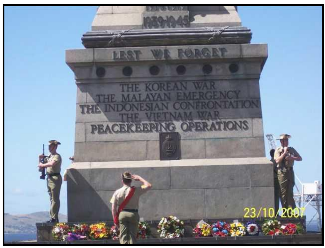
At the conclusion of the wreath-laying ceremony and after the Last Post had echoed across the Derwent River – the Honour Guard snapped to attention for the stirring sounds of Reveille