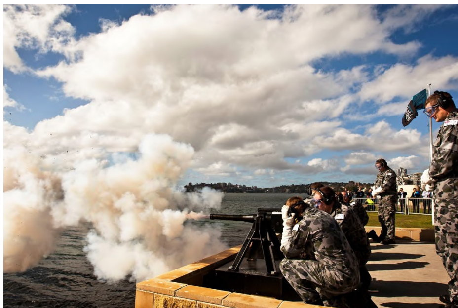
The Royal Australian Navy's Three Pound Saluting Gun Battery fires across Sydney Harbour from Garden Island Naval Base, in preparation for the International Fleet Review

The International Fleet Review focused the attention of the nation on the centenary of the RAN and reminds us of the role that gunners have played and continue to do so in that service. They have fired the broadest range of guns, from 12 inch down to rifle calibre guns, from warships, defensively equipped ships, armed auxiliary cruisers and on land carriages.