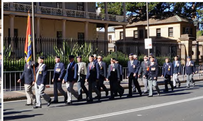
Left: 21 Field Regiment Association Above: 18 Light Anti-Aircraft Regiment