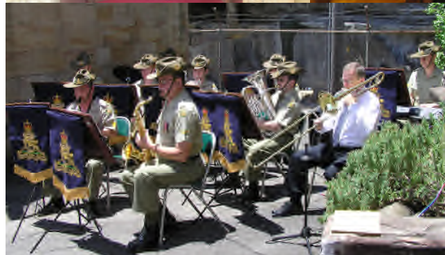
PHOTOGRAPHS FROM THE St Barbara's Day Service ARCHIVES