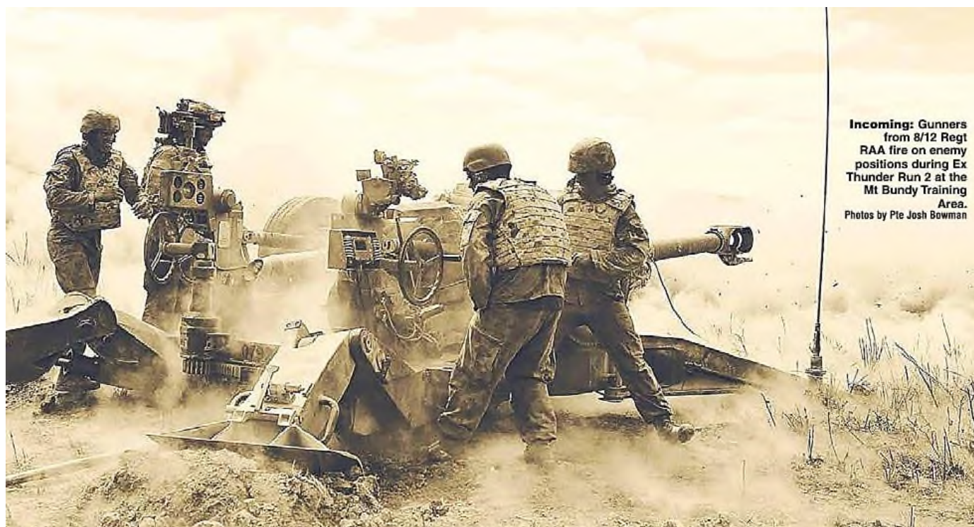
Incoming: Gunners from 8/12 Regt RAA fire on enemy positions during Ex Thunder Run 2 at the Mt Bundy Training Area.

A detachment of 8/12 Regt in action during EX THUNDER RUN 2 at the Mt Bundy Training Area. In the latest round of re-structuring the detachment commander is a bombardier. In support of 5RAR they brought danger close missions in to 175metres.