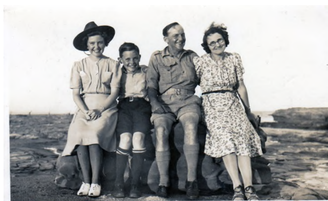
Right: Wireless Operator