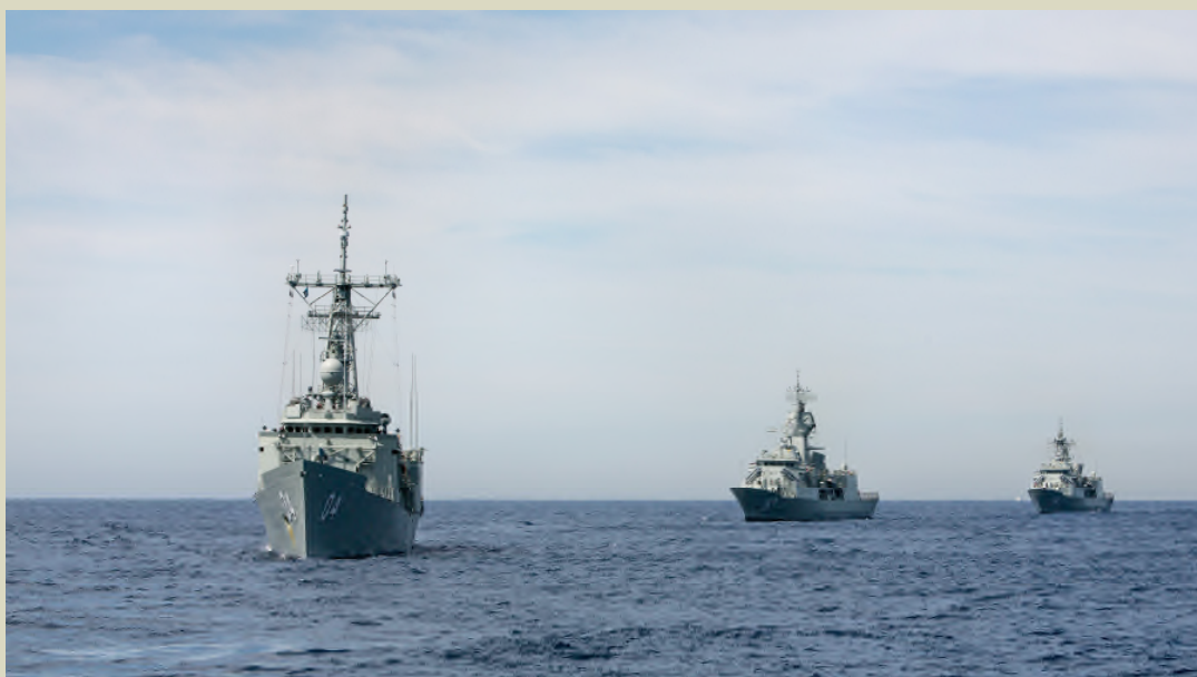
4 Oct 2013 HMAS Sydney leads the fleet into Sydney Harbour

The President and Members Congratulate all ranks of the Royal Australian Navy On a Centenary Of Service