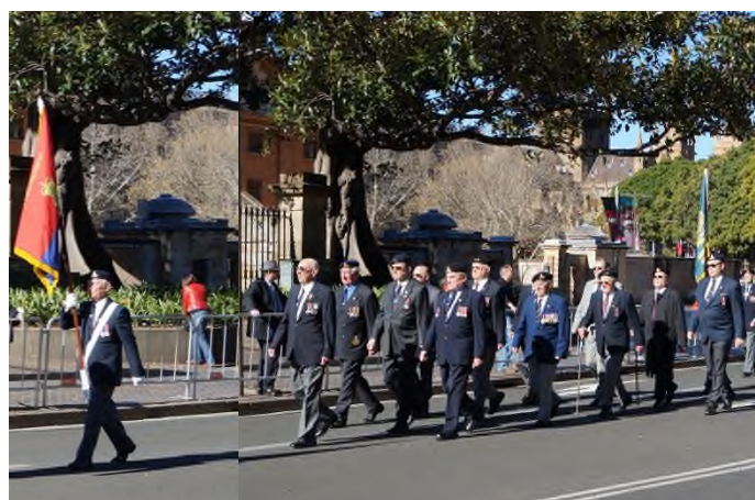
Left 7 Field Regiment Below The Artillery Band