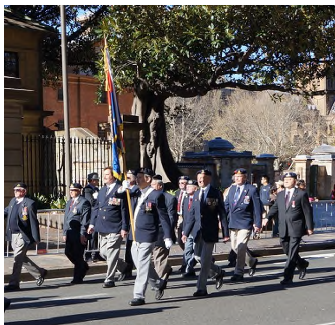
Left 23 Field Regiment

Her Excellency, Professor Marie Bashir, AC CVO took the salute of the associations