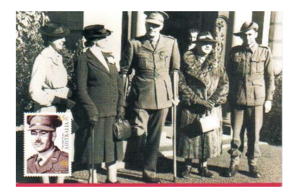
Message on the Reverse Side 'What a life! What a man! An inspiration to us all.'